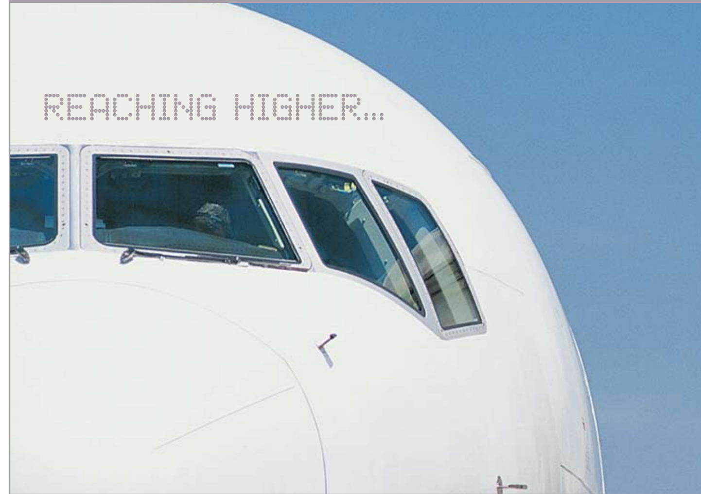
Lexan* XHR6000 Sheet

SABIC Innovative Plastics is a trademark of SABIC Holding Europe BV • Trademarks of SABIC Innovative Plastics IP BV © Copyright 2008 SABIC Innovative Plastics IP BV. All rights reserved.